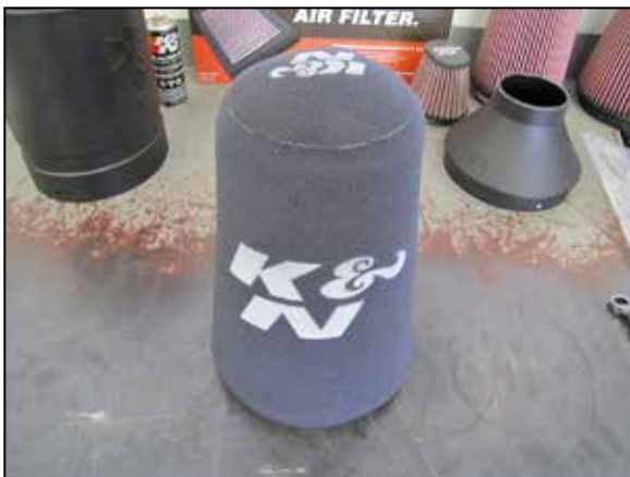
1. Install the Extreme Duty Foam Wrap onto the filter.