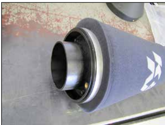
2. Install the radius filter adapter into the air filter and secure with the provided hose clamp.