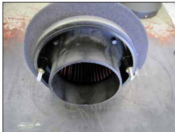
3. Install the two provided 6mm studs into the radius filter adapter as shown.