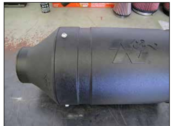
6. Install the canister lid onto the canister and secure with the provided hardware.