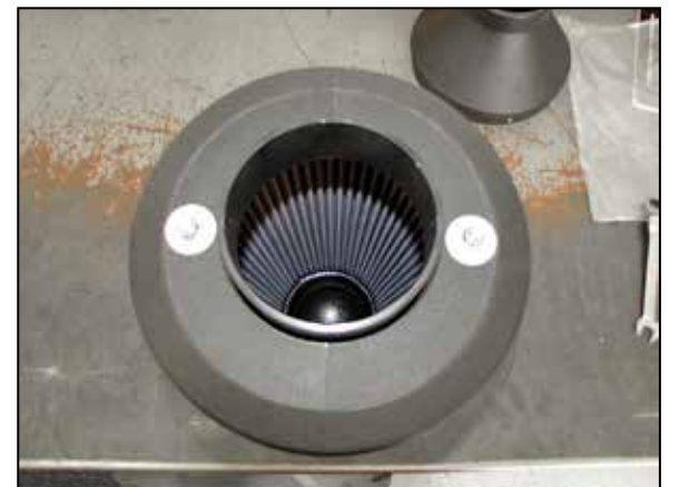
5. Secure the filter assembly to the canister with the provided fender washers and nuts.